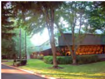
Headquarters, Eugene Oregon, USA

Datalogic Scanning bar code scanners have been setting industry standards with the distinctive hallmark of high quality products, cutting-edge technology, meticulous design, and proven reliability. For three years in a row, Datalogic has been named as the world-wide leader in total global shipments of stationary bar code scanners with the Magellan® family of bi-optic scanners as measured by Venture Development Corporation (VDC), an independent technology market research and consulting firm.