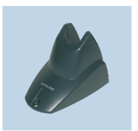
STD Heron<sup>™</sup> Hands-free Stand with optional metal plate

SP TRADERS SRD Infotech Pvt.Ltd. C/2, Avanti Apartment, L.M. Road, Navagaon, Dahisar-(W), Mumbai-400 068. Mobile: 9820429309 / 9321026721 Ring: +91-022 28950137 E_MAIL:sptraders99@rediffmail.com info@srdinfotech.com www.srdinfotech.com